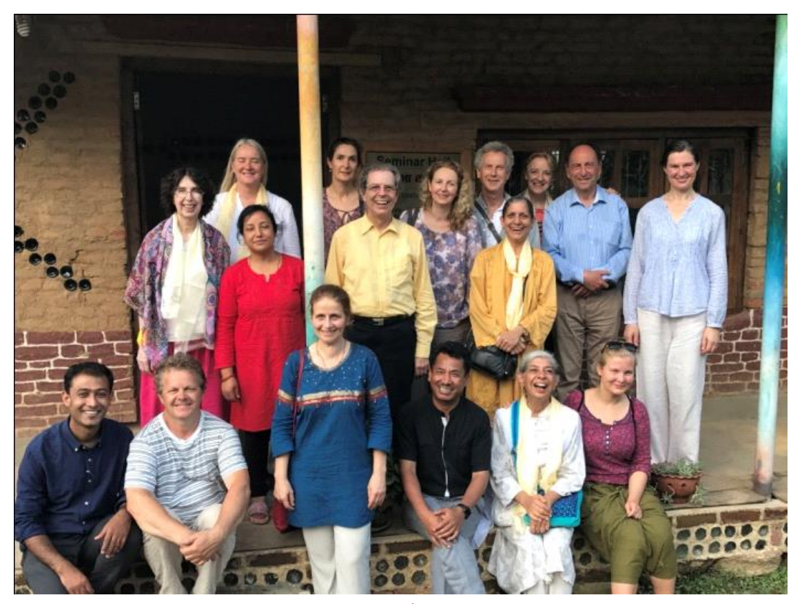
Group picture with KRMEF team.