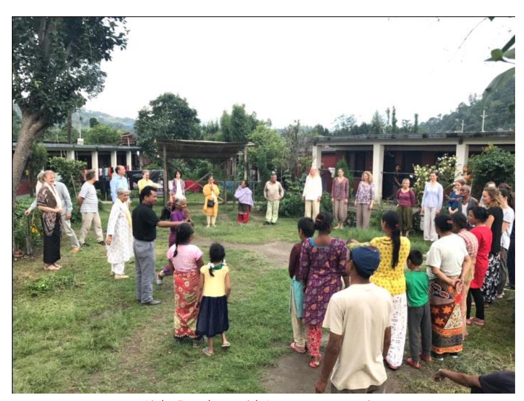
Light Eurythmy with Leprosy community

The Ensemble also received a tour of the foundation and was able to learn more about the goals of the foundation and current projects. The tour included a visit to a nearby leprosy community where they learnt about the people in the community. Light Eurythmy Ensemble then informally conducted their final performance there without any costumes or additional facilities.